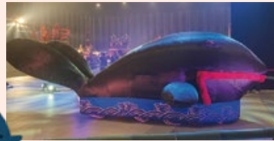
↑ The whale-shaped float used in Kunchi