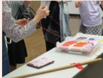
① Prepare the thread.