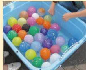
↑ Yo-yo fishing