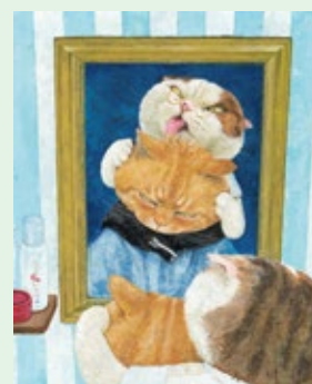
“Neko wa Rusuban” original artwork, Holp Shuppan 2020