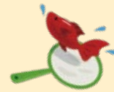
↓ Goldfish scooping