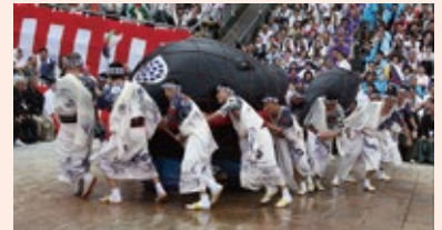
↑ The "whale" is moved around by men